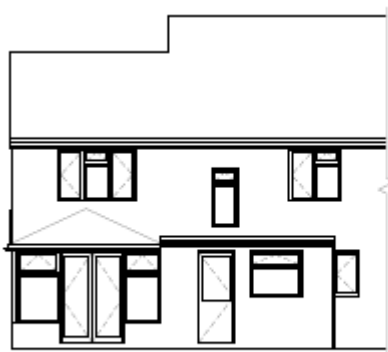
Existing North (rear) Elevation 1:100